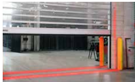
Pathwatch II in Door Threshold

Intelligent, continuous monitoring of threshold activity and door operation