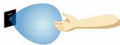
Wave-to-Open Touchless Activation

LZR®-WIDESCAN provides 'virtual pull cord activation' and enhanced flexibility and traffic interaction