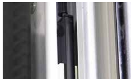
Advanced 3 Light Curtain in Side Column