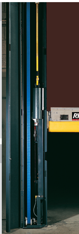
Side column with patented System II ®