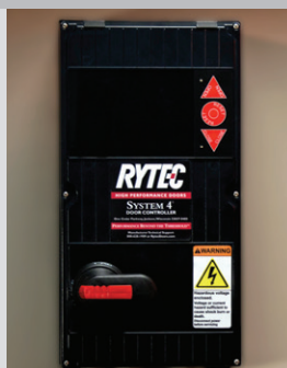
System 4 shown with optional rotary disconnect

Standard maximum sizes shown; larger sizes may be available upon request.