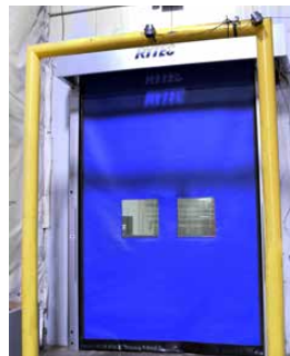
Shown with optional vision windows