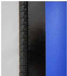
Durable drive teeth remain intact under high pressure

The FlexTec also features an exclusive 1-ply Rylon™ panel material, providing increased durability and improved wind and pressure resistance over vinyl panels typically used by competitors. In addition, a low-friction drive system (patent pending) is standard. Also available is the FlexTec™-T (tall) model for openings up to 20 feet in height.