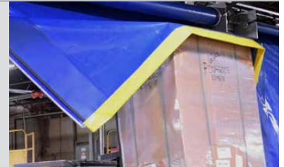
Panel resets if impacted