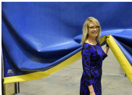
Flexible panel eliminates entrapment concerns