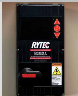
System 4 shown with optional rotary disconnect