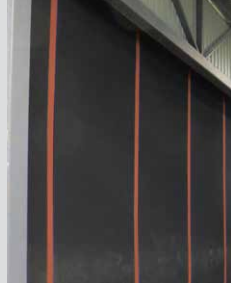
Vertical stripes for added safety