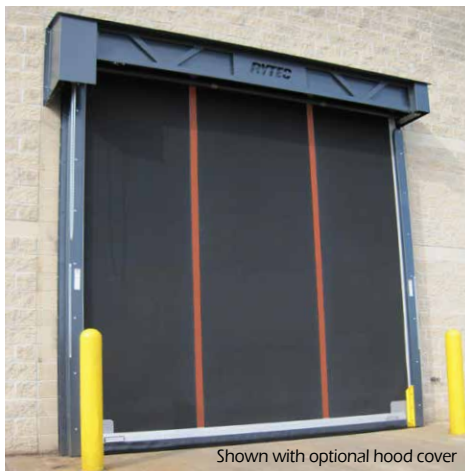
Shown with optional hood cover

The Powerhouse SD door is virtually indestructible while offering power, performance and dependability to meet the demands of the world's most extreme environments.