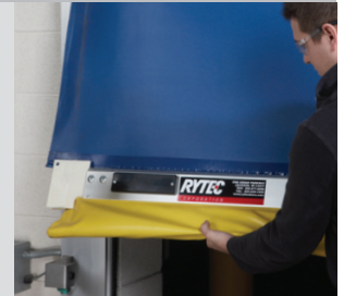
Quick-Set tabs for damage free release