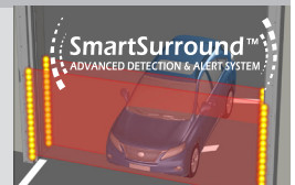
SmartSurround™ light curtains and LED light strips provide 4-corner perimeter guard