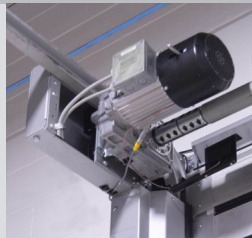
Variable speed motor