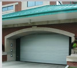
Spiral® door with solid slats