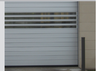
Solid and vision slats shown

Standard maximum sizes shown; larger sizes may be available upon request.