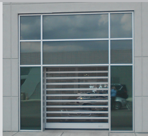
Nine-inch high vision slats for increased visibility