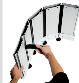
Integral rubber weatherseal