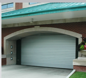
Sleek six inch high slats shown