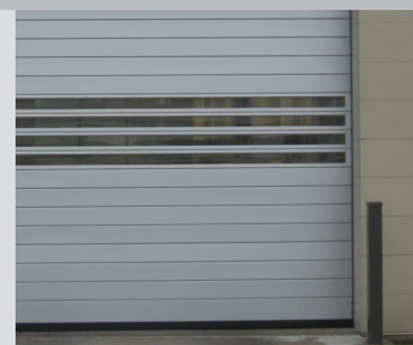
Solid and vision slats shown