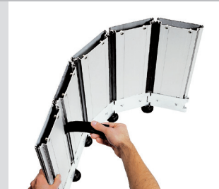
Integral rubber weatherseal