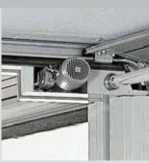
Variable speed motor