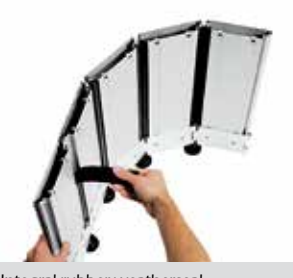
Integral rubber weatherseal