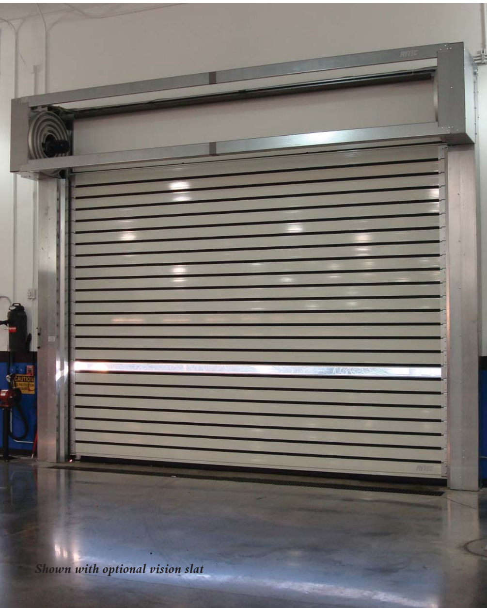
Shown with optional vision slat

Energy Efficient and Tight Seal - Aluminum slats, along with a durable rubber membrane which covers their aluminum connecting hinges, provide a 100% seal against dust pollution, drafts, and inclement weather. Optional insulation simply adds to the energy savings.