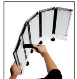
Integral rubber weatherseal