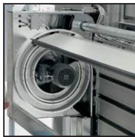
Compact AC Drive Motor