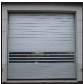
Shown with optional vision slats