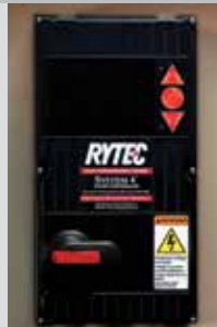
System 4 shown with optional rotary disconnect

Standard maximum sizes shown; consult factory for other sizes.