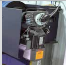
Direct drive motor