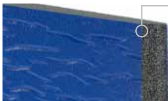
Rylon™ Thermal Panel

Ideal for non-live traffic interior applications where speed, low maintenance and dependability are critical for everyday operations.