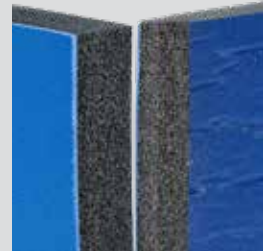
Rylon (3.0) Thermal Panel