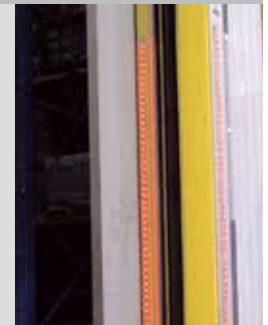
Pathwatch Safety Light System