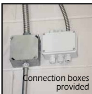
Connection boxes provided