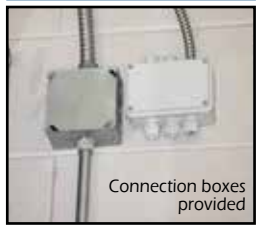
Connection boxes provided