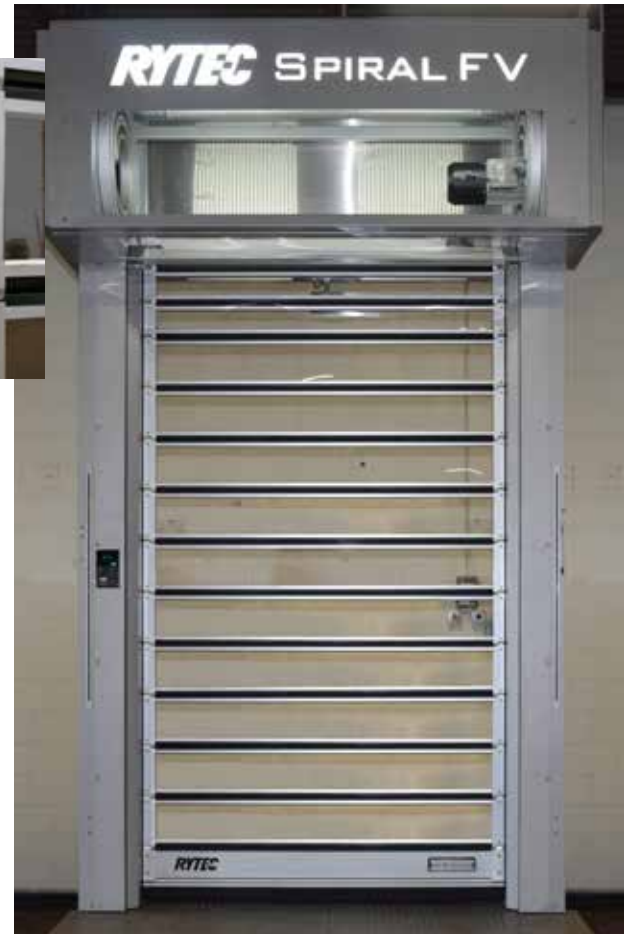
Integrated into side column or remote installation Note: Power disconnect by others

FACTORY TESTED, CERTIFIED AND WARRANTIED