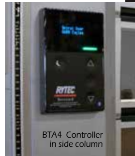
BTA4 Controller in side column