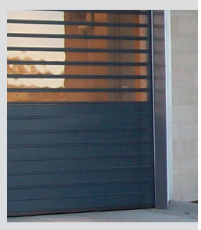
Optional vision slats shown

*Side columns and head console; excludes some US/R models.