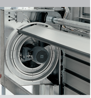
AC drive motor