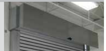
Optional hood and motor cover shown