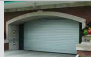
Six-inch high slats shown