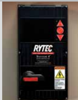
System 4 shown with optional rotary disconnect

Standard maximum sizes shown; larger sizes may be available upon request.