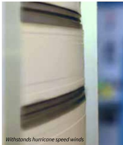
Withstands hurricane speed winds