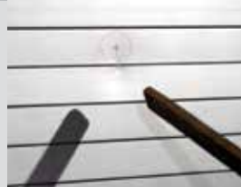
Heavy-duty panels built to withstand impact