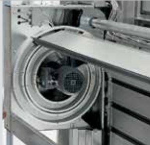
Variable speed motor