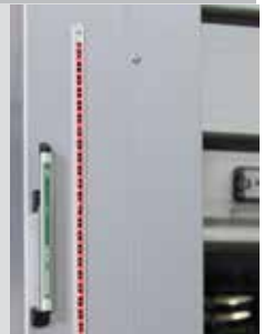
Pathwatch warning lights and brake release lever shown