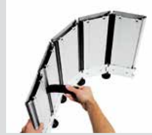
Integral rubber weatherseal