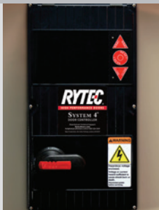
System 4 shown with optional rotary disconnect