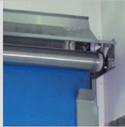
Hinged drip guard lifts up for easy cleaning