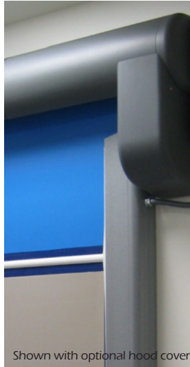
Shown with optional hood cover