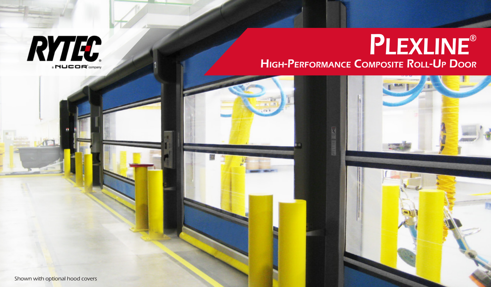
Shown with optional hood covers