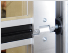
Rollers with sealed roller bearings