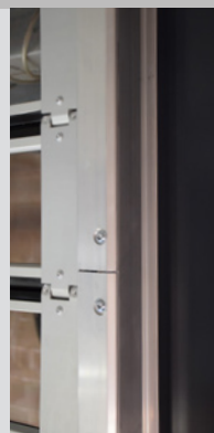
Low-profile side track