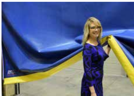
Flexible panel eliminates entrapment concerns