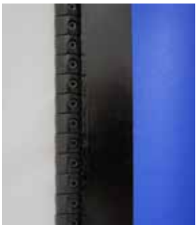
Durable drive teeth remain intact under high pressure