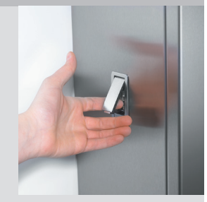
Flush manual release

Counterbalanced manual release system incorporates fully-enclosed counterweight and brake release allowing door to open with the flip of a lever