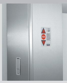
Flush membrane switch allows controls to be mounted remotely