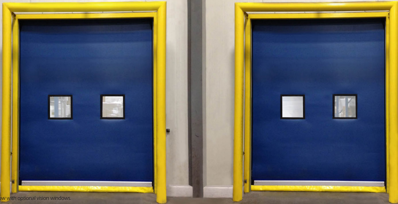
Show with optional vision windows.