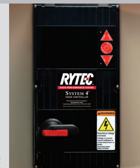
System 4 shown with optional rotary disconnect