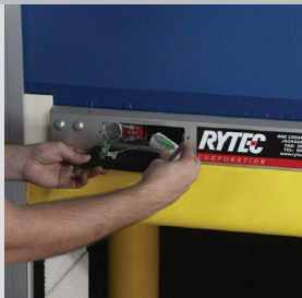
Automatic sleep mode extends battery life