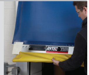
Quick-Set tabs for damage free release