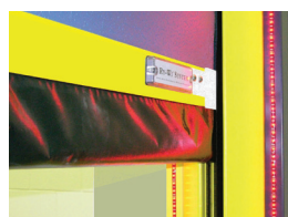
Pathwatch on side column

The next-generation Pathwatch II system projects a pair of red stripes across the door threshold during a variety of user definable events. Available for both Rytec System 4 door controllers as well as existing doors with System 3 controllers. The Pathwatch II uses steady, slow flashing and fast flashing modes to indicate door activities such as door is about to close, pathway is not clear to pass, door is in automatic/faulted mode and door is closing.