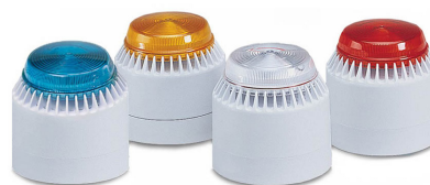
360 Sounder/Strobe Lights

Typically used in industrial environments or applications where traffic rates are higher. Careful selection in applications with a high population of other signaling lights is necessary to insure distinction.