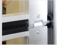
Rollers with sealed roller bearings