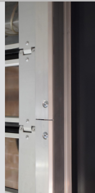
Low-profile side track