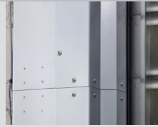
Powder coated side column cover