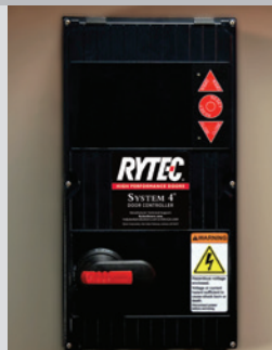
System 4 shown with optional rotary disconnect