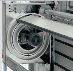
AC drive motor