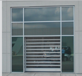
Nine-inch high vision slats for increased visibility