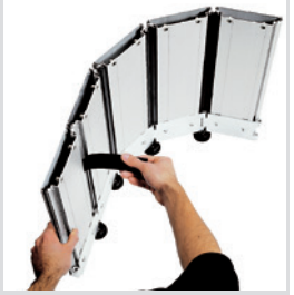
Integral rubber weatherseal