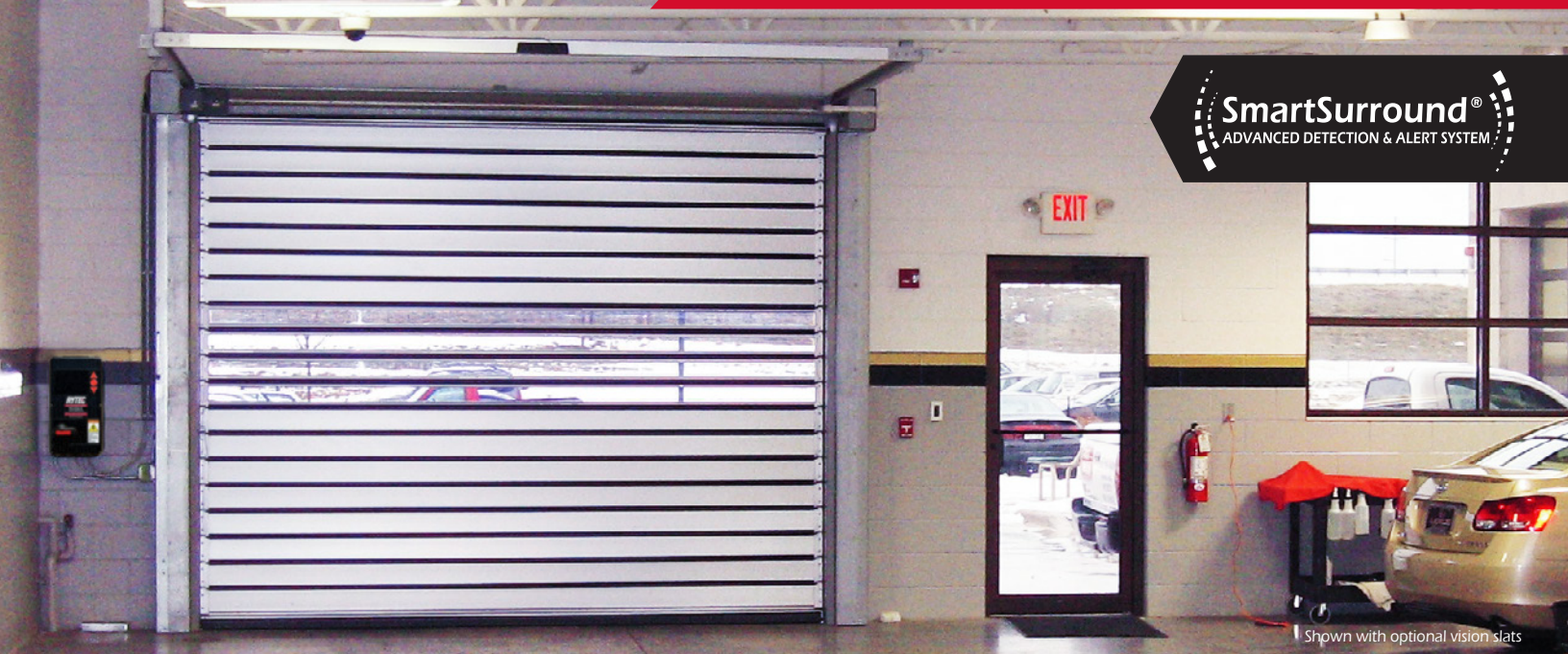
Shown with optional vision slats