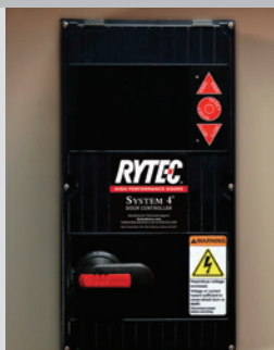
System 4 shown with optional rotary disconnect