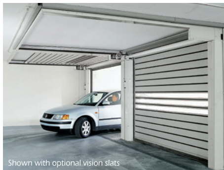
Shown with optional vision slats

Spiral LH high performance is guaranteed with a 5-year limited warranty .