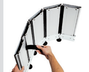
Integral rubber weatherseal