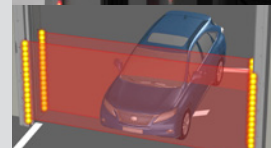
SmartSurround® light curtains and LED light strips provide 4-corner perimeter guard