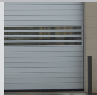
Solid and vision slats shown

Standard maximum sizes shown; larger sizes may be available upon request.