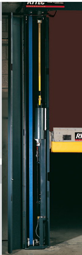
Side column with patented System II ®