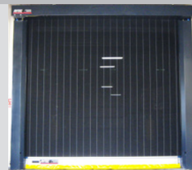
Full screen panel shown